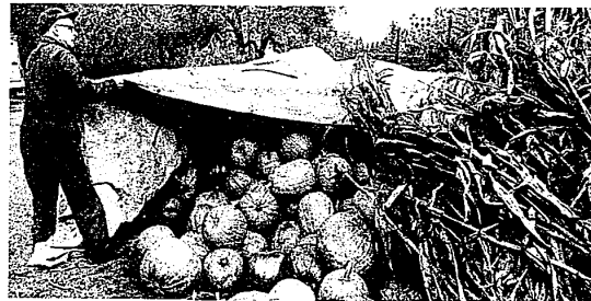
Sheltering pumpkins from the frost requires a tarp and a lot of manual dexterity as Louis White of Gravelins demonstrates at