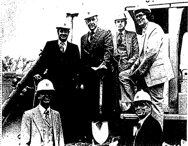
Those are some hats, guys

All the children's programs begin the week of Nov. 12 and run for five weeks, through the week of Dec. 14. For further information, call the Farmington branch at 474-7770 or the Farmington Hills branch at 553-0300.