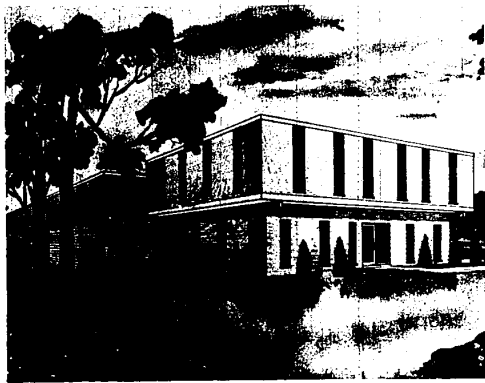
NEW PLANT — This is the architect's sketch of a new 50,000 square foot plant under construction in the Farmington freeway Industrial Park. The new office and manufacturing center of Ace Controls, Inc., the plant is expected to be completed by early November. The firm, which manufactures industrial shock absorbers, flow controls, check valves and related fluid power accessories, employs about 30 people. The three-year-old firm is forced to move from its present location at Eight Mile and Merriman Rds. because of the need for additional space.