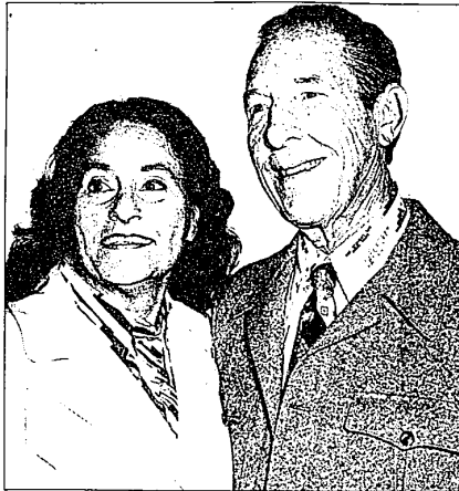
I love a mystery