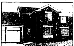
PRIVATE Bloomfield Hills complex of 45 townhouses. Spacious 3 bedroom, 2 1/2 bath home with fireplace family room. 10% NEW MORTGAGE. 25% DOWN! 848-8000. $108,000.