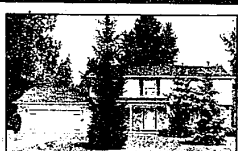
PRIVATE PINE LAKE beach and boat docks close to this large 5 bedroom Colonial with fireplace family room, central air. Bloomfield Hills schools. LAND CONTRACT! 851-8100. $162,500.