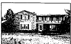
LATHRUP VILLAGE Estate offers 5 bedrooms, 3 full and 2 half baths, private library and family room with Fieldstone fireplace, other lovely features to enjoy. 557-6700. $155,000.