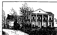
PALATIAL Homestead overlooks Great Oaks Golf Course, has indoor pool, plus library, 4 bedrooms, fireplace family room with wet bar, prime SIMPLE ASSUMPTION. Rochester. 651-8850. $154,900.