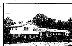
ESTATE LIVING on groomed acreage, Bloomfield Hills. Spacious quad with library or fourth bedroom, 3 1/2 baths, large fireplace family room, central air. Privileges on power boat Walnut Lake. 626-9100. $172,900.