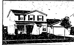
TOTAL CHARM in top North Troy area. Neutral decor in library, fireplace family room, 4 bedrooms. Cathedral-beamed and stucco ceilings. 689-8900. $102,900.