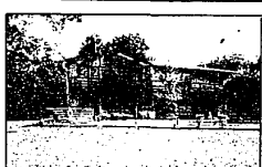
OVER THREE ACRES with stream, heated free form pool and 4 bedroom, 3 1/2 bath ranch bi-level in beautiful Beverly Hills. 2 fireplaces, first floor laundry, lovely landscaping. 557-6700. $199,000.