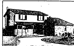
ULTRA-SHARP Colonial backs to commons area. Custom built in 1977 with wood insulated windows, added insulation, many extras. Excellent area for family. 629-9100. $109,900.