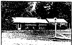
ALMOST TWO ACRES of woods and privacy for country ranch, near city conveniences. 3 bedrooms, 2 full baths, fireplace family room. Birmingham. 626-9100. $91,900.