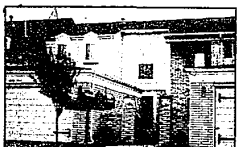
THE GOOD LIFE in lovely Rochester townhouse. 3 bedrooms, 2 1/2 baths, complete kitchen, dining room, full basement, 2 1/2 car garage. LAND CONTRACT. 651-8850. $73,500.