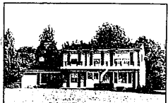
PERFECTION in Lahser-Quarton area, Bloomfield Hills. Superb fireplace family room, private library, nice recreation room, new kitchen. GREAT ASSUMPTION. 847-5100. $128,500.