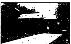
CHARM in Southfield Tri-level. Family room views stream, Willow and Apple trees. 3 bedrooms, 1 1/2 baths, fireplace in living room. A must see home. 557-6700. $69,900.