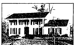
OVERLOOKS STREAM , commons area from high setting. King-size 5 bedroom, 3 1/2 bath home with huge fireplace family room, 45' x 22' walk-out recreation room, bar, 2-story foyer. 626-9100. $149,900.