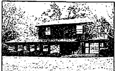
PRIME ASSUMPTION adds value to rustic Colonial in Rochester. 4 bedrooms, plus fireplace family room with wet bar, finished recreation room, more. 651-8850. $122,900.