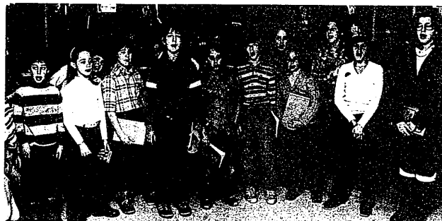
Students gather in a semi-circle as they entertain the seniors Monday night. All the children are Hebrew school students at Adat Shalom synagogue.