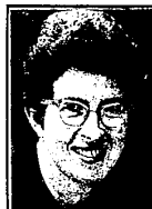
By MARGARET MILLER Women's Editor

Wonderland Center Plymouth at Middlebelt Photograph Studio - 2nd floor