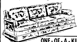
ONE-OF-A-KIND DESIGNER COLLECTION