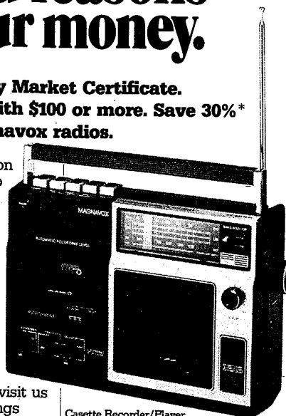
Cassette Recorder/Player with AM/FM Radio. Everything comes thru clearly and you can record directly from the radio. Or externally. Push-button tape controls and automatic stop.