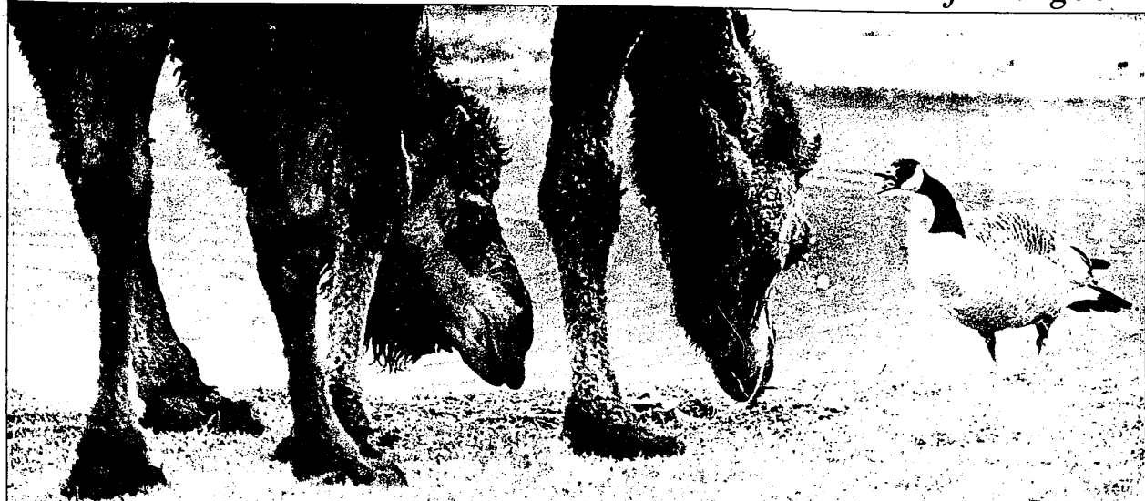
Above: A Canadian goose tries, unsuccessfully, to scare away two grazing camels.