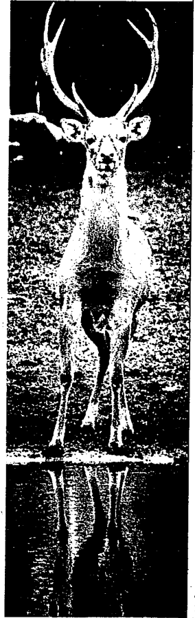
Above: A Formosan deer.