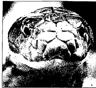
Above: A king cobra.