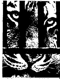
A tiger peers through his bars.

Zoo hours these days are 10 a.m. to 4 p.m. Wednesday through Sunday. Ad-