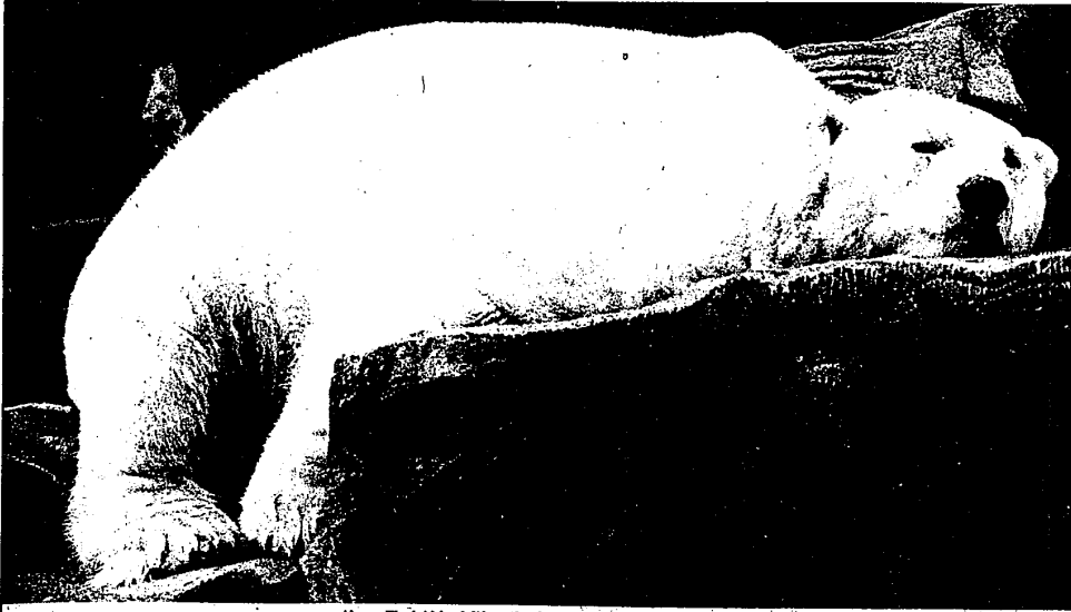
Above: The laid-back life style of a polar bear basking on a rock.