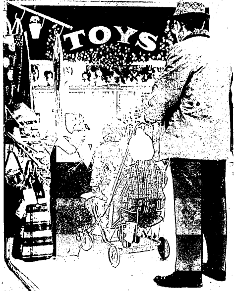
Mother has hard time keeping wide-eyed kiddies in go-cart.