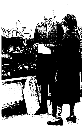
Christmas list has attention of these grandparents.