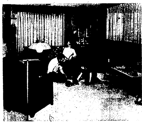
FINISHED ROOM has wall-to-wall seamless flooring of sunstone gray, applied 'right over old tile. Seamless flooring's hard, durable surface has tough polyurethane surface that never yellows and needs no waxing.

Repeat the operation in two by four-foot sections.