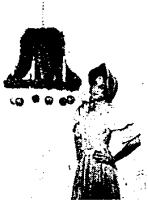
KISSING BELL — The great great-grandparents of this young lady probably knew the Christmas kissing bell much better than she does. The 18th century Christmas decoration is just one of reminders of Christmas Past now on display in Greenfield Village.

It's holiday time and if the chores of shopping, wrapping presents and addressing Christmas cards is catching up to you, a visit to one of the Christmas exhibits might be a relaxing change of pace. There are two main exhibits in the metropolitan area and another in Windsor. Both the holiday program at Greenfield Village and the Christmas Carnival in Cobo Hall, sponsored by the City of Detroit are annual events. In Windsor, the Christmas exhibition at Willstead is open through Jan. 31 under the sponsorship of the Art Gallery of Windsor.