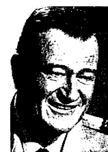
JOHN WAYNE stars in "The Undefeated" which is currently showing at area theaters.

All the demonstrations begin at 7:30 p.m., except for the program scheduled in the Wayne YMCA which begins at 8 p.m. The Gabriel Richard course, with more than 20,000 graduates, focuses on motivation and leadership skills. The course is offered to adults from all walks of life at a modest fee because the Institute is a non-profit service organization. Classes are limited to 25 persons. There is no charge or obligation for the demonstration.