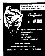
High fashion styling, hair, makeup, and more. Call for more information. 2925 Ford, GA 15066, GA 3900.

A special 50% discount is offered to students on the evening of each Wednesday and Thursday performance. Students are asked to present current I.D. cards at the box office by 8:15 p.m.