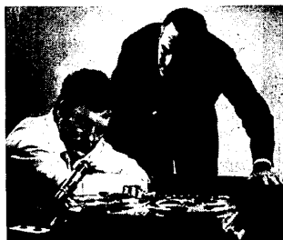
NOW SHOWING — Tony Curtis and Henry Fonda star in the film "The Boston Strangler" currently showing at the Algiers Drive-In in Westland.