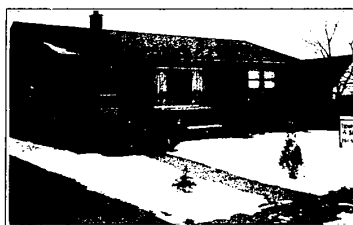
REDFORD OPEN SUNDAY 2-5

Beach Day to Graham Road—Follow Signs NEW YEAR BUDGET... Low taxes and low price make this lovely custom built home easy to fit your budget. It has large carpeted living room and dining area, modern kitchen, ceramic tile bath, spacious family room, 2 bedrooms, 2 1/2 car garage, nicely landscaped yard, terrace, pleasant neighborhood, near Western Golf Course. $24,500. 261-5080.