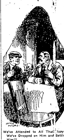
We've Attended to All That 'Izzy'—We've Dropped on Him and Settled Him!

Hammond stood staring after the astounding figure for a moment he was speechless. The jaunty words had sent terror thrilling into him. He started impulsively to pursue that impudent aviator—then he checked himself.