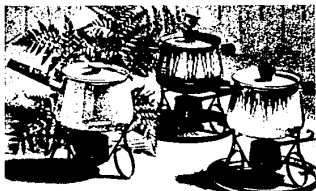
TWO STYLES - New fondue servers come in two styles - one with a wooden handle and the other with side carrying handles