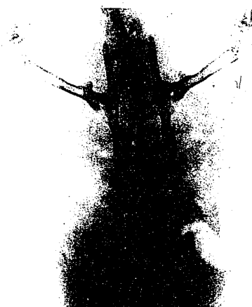
X-rays tell the story of how food can affect bone structure. The rat at the left received a well-balanced diet including calcium, and his bones show up well defined. At the right, on the rat that went the soft drink