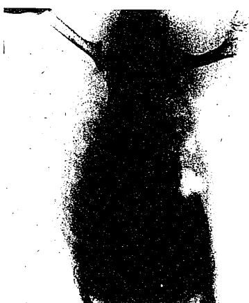
and French fries route, decalcification is beginning and the bones are not well defined.