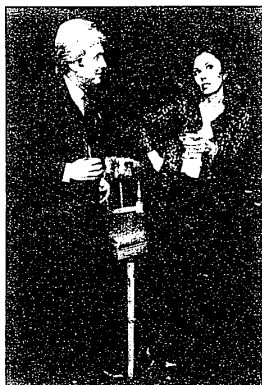
She'll look into the glorious future wearing a black ruffle collar sequined lace jacket, white crepe camisole and slender black crepe evening pants. Jacket, $155 at Michael Getzoff, Birmingham. Her escort is also in navy blue pinstripe, this a wool blend vested suit, $275 at Tottingham's in Birmingham. His all-silk tie is by Liberty of London, $16.50.