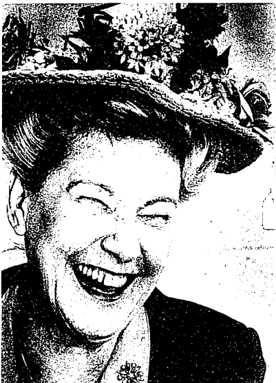
Wearing her famous hat with a price tag on it, Minnie Pearl laughs heartily during her recent area visit.

She remembers well her 30 years of one-nighters, the adventure and the hard times "when there was nothing to do but cry or be silly."