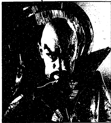
Emperor Ming (Max Von Sydow) rules the universe in the adventure-fantasy "Flash Gordon," opening Friday at Detroit-area movie houses.