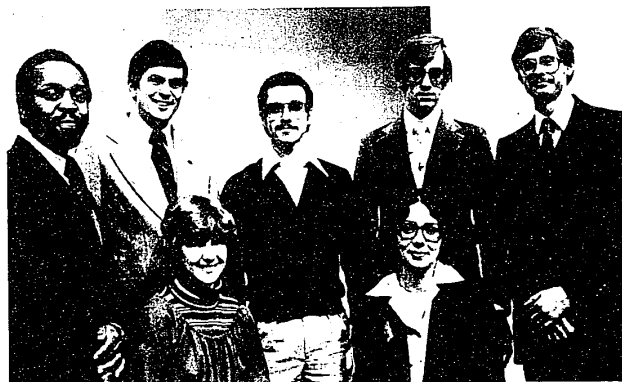
Selected for Who's Who

Because of the poor economy, it is hoped that more residents will save their waste paper to donate to the church's effort.