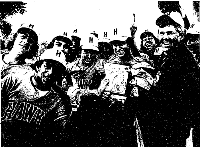
Harrison's baseball players whoop it up after winning a state Class B regional championship at Riverview High School.