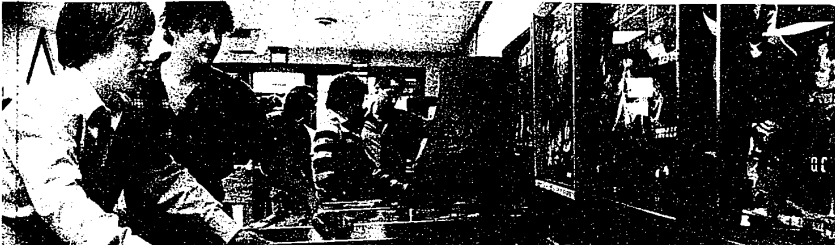
Pinball can offer an afternoon of indoor fun for the young and young at heart such as this group at Abbey Road Amusements in Farmington Hills.

FOR THOSE WHO prefer the confines of the library, the Farmington branch of the library, the Farmington branch of the Farmington Community Library on Liberty and the Farmington Hills branch on 12 Mile east of Farmington Road is open from 9 a.m.-9 p.m. Monday-Thursday. Both libraries are open from 9 a.m.-5 p.m., Friday and Saturday.