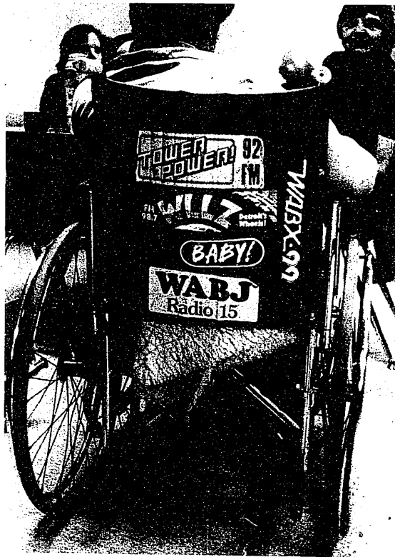
A physically handicapped person likes to sport radio station promotional bumper stickers on the back of his wheelchair.