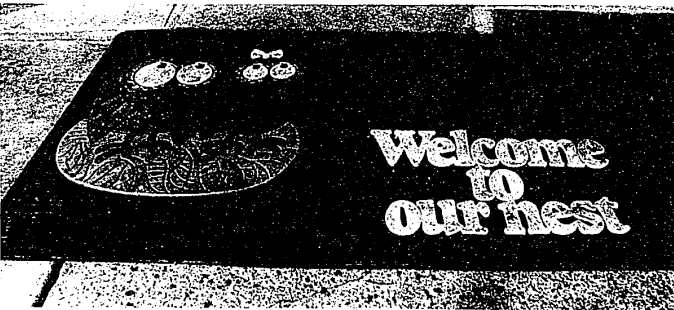
"Welcome to our nest" is the message at the front door of the Wentworth house.