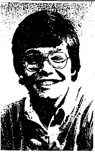
Carrier of the Month farmington

The first portion of "Bid With Heart" will be devoted to a series of silent auctions where bidders see gifts displayed and then record their bids in writing.