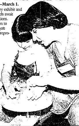
Photo seminar is set

THE EDISON INSTITUTE Henry Ford Museum & Greenfield Village