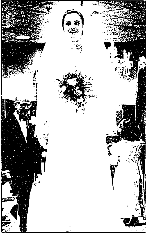
Crystal pleats add a special touch to this gown with a V-neck and matching veil.