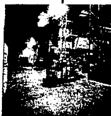
FROZEN FOOD COOLERS

Control Board in Dairy Section enables operator to automatically select desired milk product, switch into packaging line. 129,000 gallons of raw milk is under controlled, cool conditions.