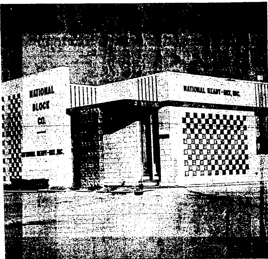
NATIONAL BLOCK CO. and National Ready-Mix Co., Inc., 39000 Ford Rd., Westland, has recently completed construction on its new administrative offices. The National Block Co. building has incorporated 26 different block patterns and utilizes every standard type of block now manufactured by this firm. Founded in 1946, National has grown continuously and is today the largest combined block and transit mix operation in southeastern Michigan.

The Board of Directors of Bank of the Commonwealth has declared the regular quarterly common stock dividend of 50 cents per share, payable April 1, 1970, to holders of record on March 18, 1970. There are 3,047,724 common shares currently outstanding.