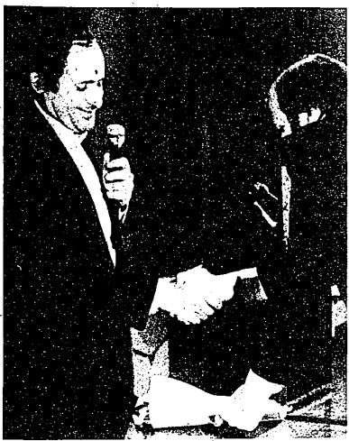
Sending a message