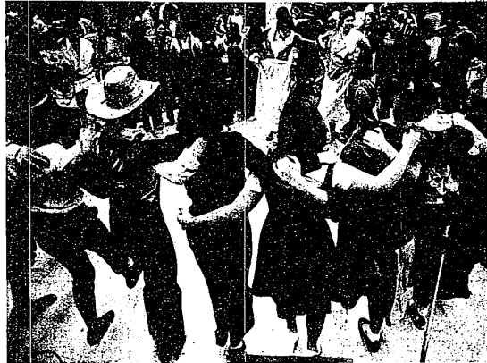
A Greek dance was one of the highlights of the evening.

A bit of Mardi Gras came to Harrison High School recently as students from the French club adorned themselves with festive garb to celebrate. Ethnic fare was a highlight of the day. Those bringing food were freed from the burden of paying admission to the activities. The dishes were specialties from around the world. Another part of the day was consumed by ethnic dancing. Costumes of ethnic groups abounded. Although identified with a festive season in New Orleans, Mardi Gras originally was started as a celebration before the Christian Lent season at which time believers sacrificed with fasting, prayers and mourning.