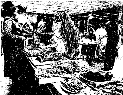
The students were admitted free if they prepared a dish of ethnic food.