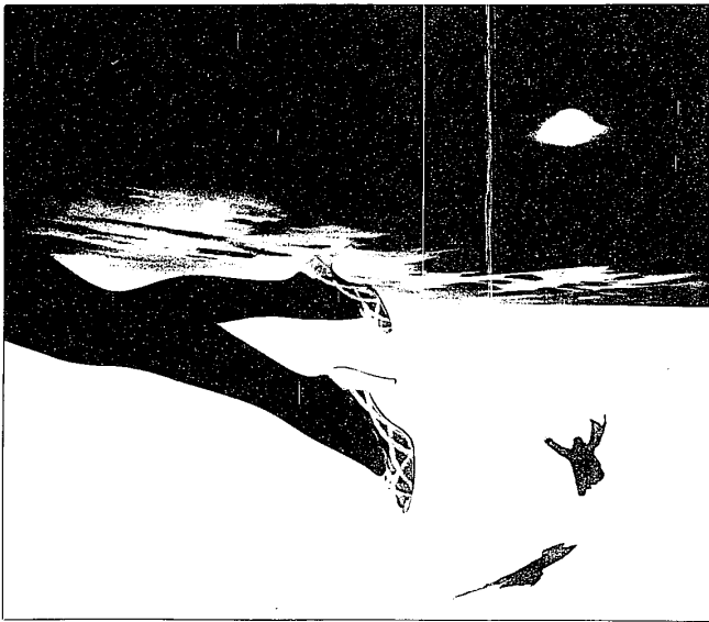
"Strip Tease" by Stuart Weitzman for Martinique $115.