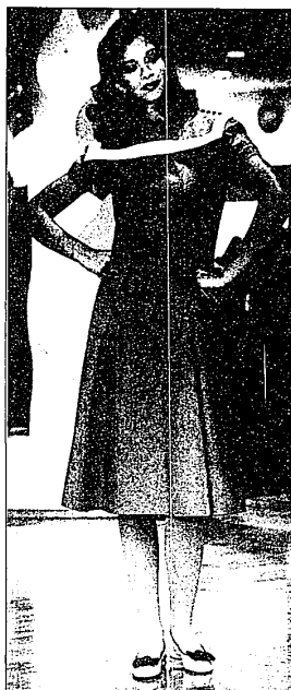
Red sailor dress piped in white is cotton duck, $230. Albert Nipon at Saks Fifth Avenue.