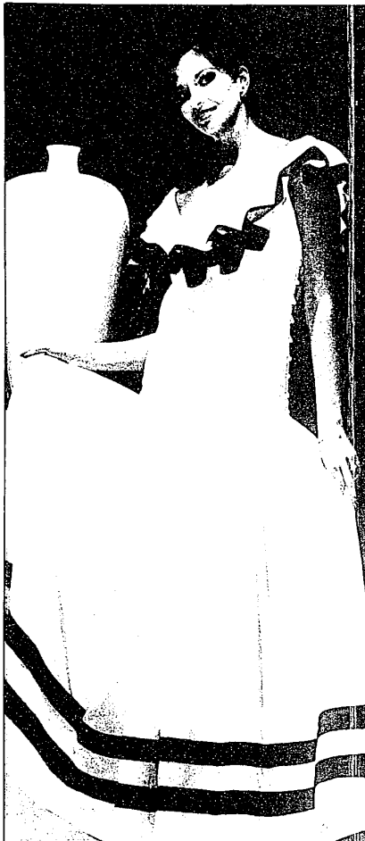
Albert Nipon's summer evenings borrow touches from bygone eras. White cotton voile piped in black horsehair from one era, dropped torso and ruffled portrait neckline are from another, $440.

Albert Nipon's Thoroughbred for summer evenings will borrow a horsehair trimmed portrait collar from one era and an elongated torso from another. Although for a period Nipon ceased designing long dresses, he said, "I've gone back to them by popular demand. Women want to look lovely, and elegant, again." Since 1972, he has resisted the whims of fashion to follow his own belief in simple, well-made dresses, he added. Nipon designs, which retail for $200 to $450, are now worn by some of the best-known, most-often photographed women in America, including