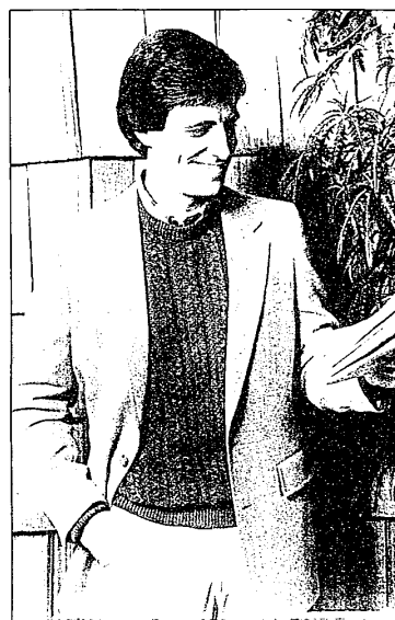
Evan Picone combines textures and fabrics with basic chino pants, an honest-to-goodness madras shirt, cotton, baby cable crewneck and fine polyester and wool blend jacket. J.L. Hudson's.