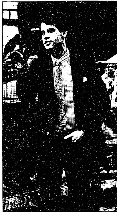
Yves Saint Laurent's go anywhere sport-coat (left) teams two textures in a silk blend black and white plaid. The trouser is also YSL in pure wool gabardine. Above, the pure wool blazer with tell-tale YSL buttons, cotton blend button-down shirt, and regulation cotton denim jeans by YSL. Jacobson's.