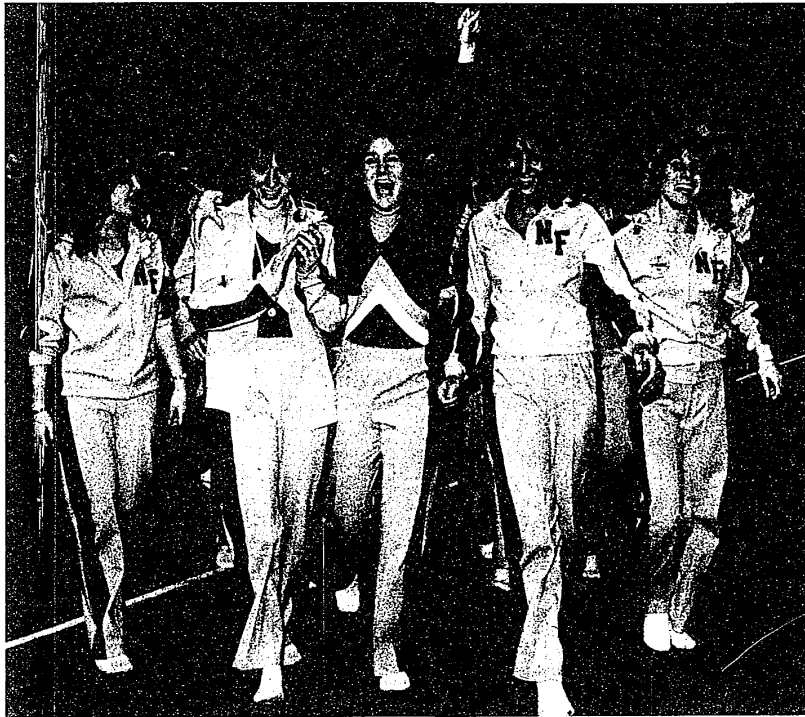
A happy group of North Farmington gymnasts leaves Troy High with the state gymnastics title.