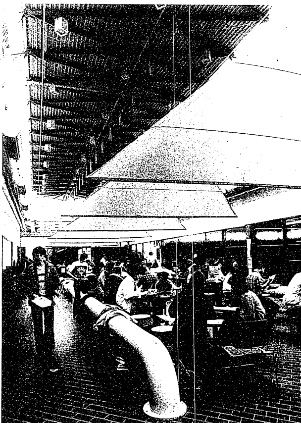
Restaurants, game rooms, blaring music and a bulletin board posting the latest victim in the campus Assassin game are standard features in the mall,