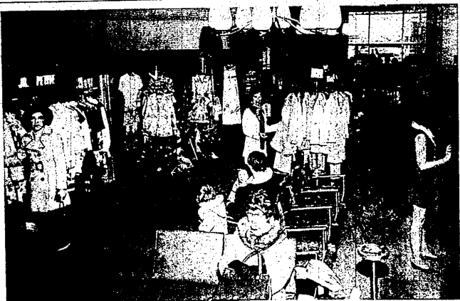
WINKELMAN'S HAS remodeled the interior of its Wonderland store.