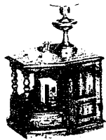
END CABINET Two doors. May be used as a right or left table, beside a chair or sofa. 25 1/2" x 24" x 22" High $169

The graceful simplicity of fine Early American design is richly captured in this exciting group. Thick turnings and heavy bases accentuate their strength and charm. Crafted of Maple and Birch Solids and veneers in a rich hand-rubbed warm dark Maple finish that correlates well with either Maple or Pine. Because of the unusual finish and the Formica tops this is one of our most popular table groups. But hurry, quantities are limited. Sale ends April 18.