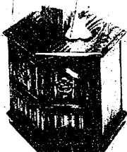
2 DOOR HEXAGON CHEST 28x24x21" High $149