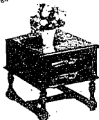
DEEP DRAWER COMMODE 28x22x21" High $139