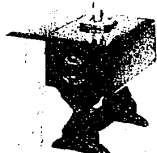
PEMBROKE TRESTLE END TABLE With drop leaves open 32x26x22" High $149