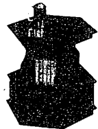
HEXAGON BOOK TABLE 23 x 20 x 22" High $129