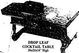
DROP LEAF COCKTAIL TABLE 38x22x16" High $159