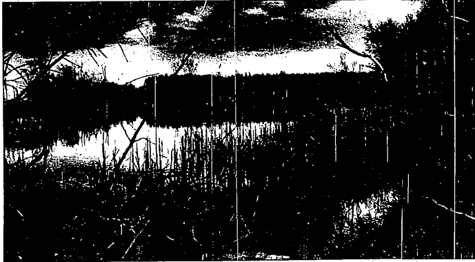
A mood of tranquillity prevails on a cloudy afternoon.