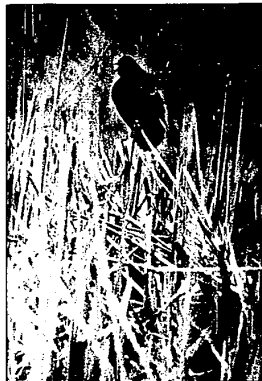
A red-winged blackbird stakes out its territory in the marsh.