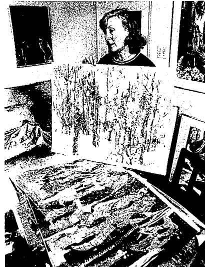
Bernice Forrest works in her dining-room-turned-studio filled with paintings in various stages of completion.