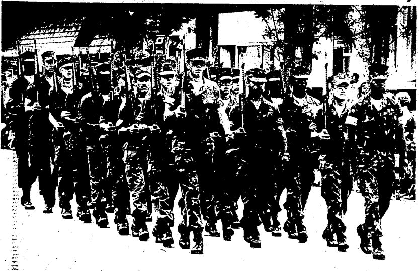
The Marines from the 1st Battalion, 24th unit, marched off with the best marching unit award.