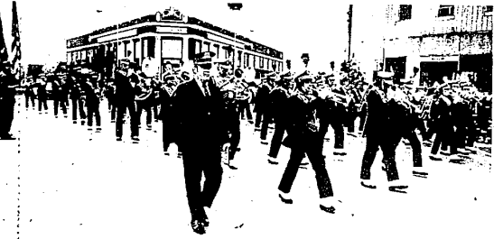
The marching band from Harrison High School took the most outstanding band award.