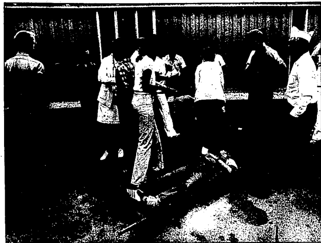
The students began arriving at the emergency room of Botsford Hospital in the morning. Each wore some type of makeup to simulate a wound and also

carried a tag describing the symptoms that the injured person would be experiencing.