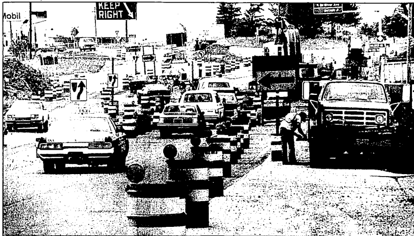
With a little help from the weather, the construction at Grand River and Ten Mile road should be completed by winter.

The job is being done by the Cadillac Asphalt Paving Company.