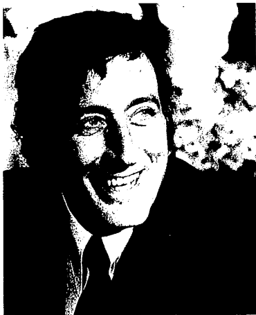
Tony Bennett will sing on Meadow Brook's Friday variety series this weekend.