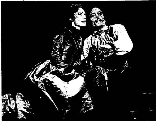
Stacy Keach (right) is P.T. Barnum and Dee Hoty is Mrs. Barnum in the first national company of the Broadway hit musical "Barnum," about the fabled 19th-century circus impresario.