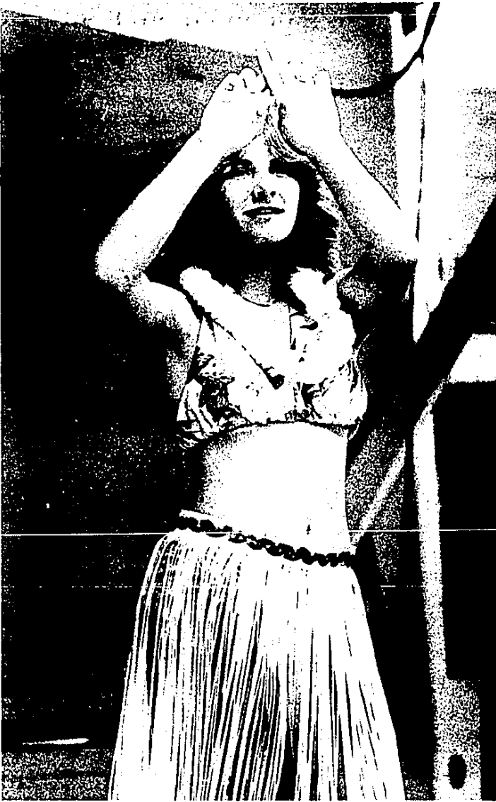
Dancing is just one of the many activities to see and do during the festival.