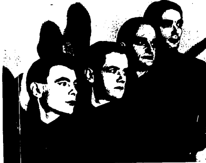
Karl Bartos (left), Ralf Hutter, Florian Schneider and Wolfgang Flür, the members of Kraftwerk, will perform their electronic style of rock at Nitro's on Saturday.