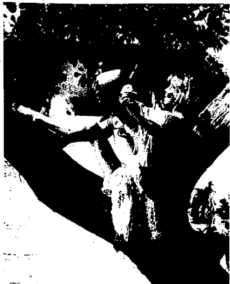
Jane Parker (Bo Derek) cools off in the steamy jungle in "Tarzan, the Ape Man." Miles O'Keefe stars as the jungle vine-slinger in this purportedly lusty remake of the 1932 classic.