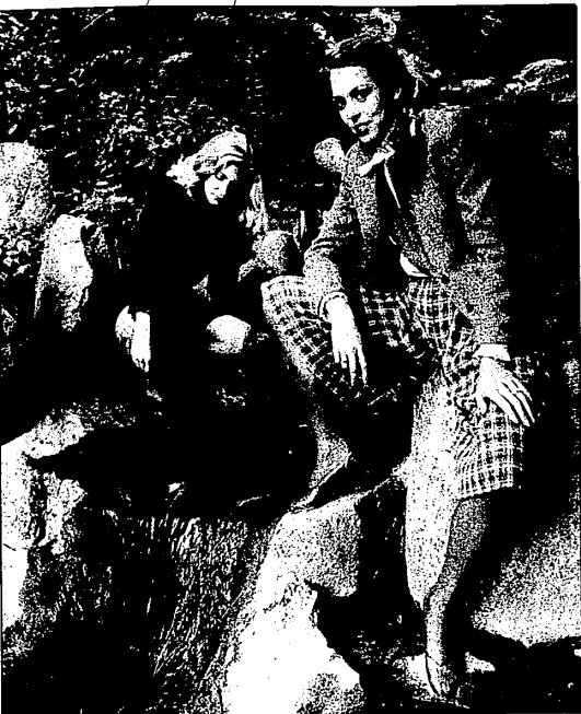
Split skirts are one of the hottest new items to hit the stores this fall. If you don't want to be left out of the trend, be sure to mix and match fabrics by texture. The woman on the left, clad in a BearWear for Juniors outfit, sports a corduroy-plumed jacket with a flange on the shoulder, with a silk blouse and embroidered thick hose. On the right, the woman wears an Evan-Picone for Juniors outfit where she teams a wool split skirt in earth tones with a tweed jacket of the same colors. Her perforated leather wedge shoe adds another texture dimension. From Saks Fifth Avenue.